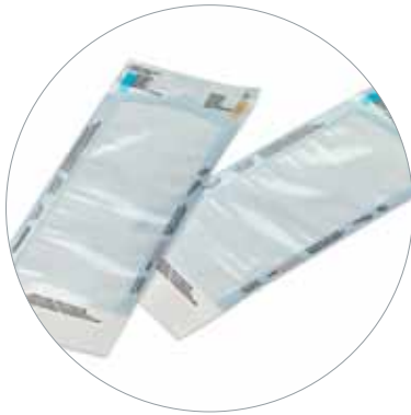
paper/film selfsealing bag