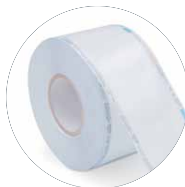
paper/film flat roll