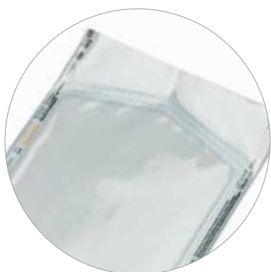
paper/film flat bag