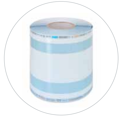
paper/film gusset roll